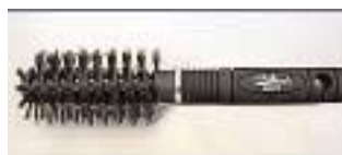
BKR12 - SMALL SPIRAL VENT