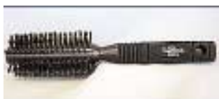
BKBR12 - MEDIUM ROUND BOAR