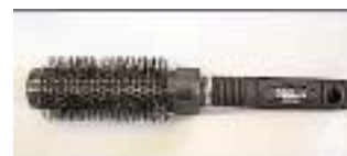
BKHC32 - HOT CURL LARGE