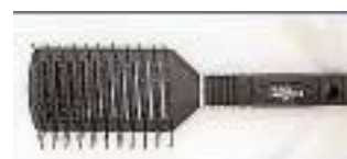
BKLV - LARGE TUNNEL VENT