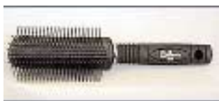
BKD THERMAL BRUSH