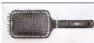
BKP - PADDLE