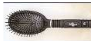
BKS LARGE OVAL CUSHION