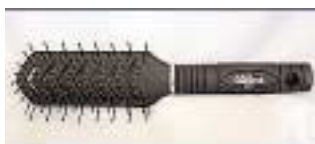
BKV - VENT BRUSH