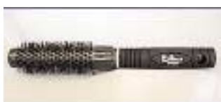
BKHC25 - HOT CURL MEDIUM