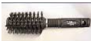
BKR16 - MEDIUM SPIRAL VENT