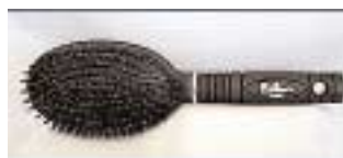
BKBS - BOAR OVAL CUSHION