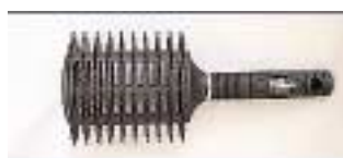
BKBP50 - OVAL 50/50