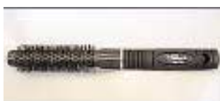
BKHC20 - HOT CURL SMALL