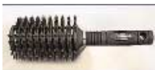
BKR20 - LARGE SPIRAL VENT

Hairtech has a range of seventeen brushes to suit every hair style.