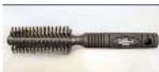
BKBR8 - SMALL ROUND BOAR