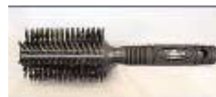
BKBR16 - LARGE ROUND BOAR